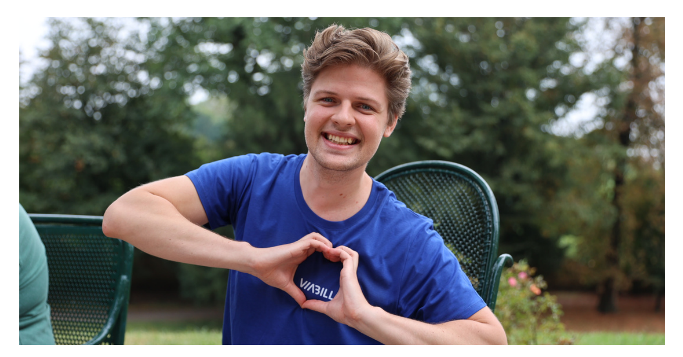
ViaBill | CSR Report 2023

Thanks to all these initiatives and the valuable feedback gathered from them, ViaBill has been able to constantly improve over this past year, and we plan to keep doing so in the future. The input obtained has been reflected in new upcoming features, such as Payment Date Selection; more education and workshops for our employees; and changes in the dynamic for our yearly company trip, with more focus on socializing.